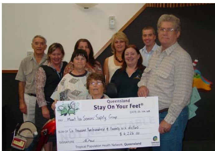
Seniors Safety receiving funding from the Stay on your Feet initiative.