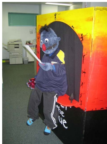
Puppets to the Rescue –Bluey hard at work