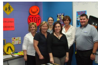
Northwest Road Safety Group and their fantastic demonstration of materials