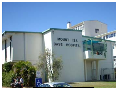
Mount Isa Base Hospital