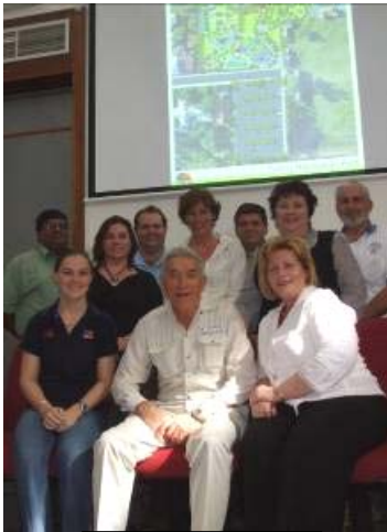
Mount Isa City Council

Members of the team were pleased to read of the efforts to build and maintain this capacity through the Research Capacity Building Initiative (RCBI). The engagement of the current Director of Research and Development at the Mount Isa Centre for Rural and Remote Health as RCBI coordinator as well as additional evaluation capacity building support through various Government departments and the Building Safer Communities team is to be commended.