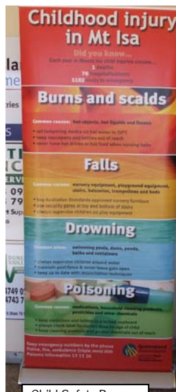
Child Safety Banner

Site visit team members were disappointed that minimal injury and surveillance data were included in the application. However it was evident at the site visit that documentation of the frequency and cause of injuries is occurring and that data are effectively used to inform project development and ongoing monitoring. At the site visit, team members were supportive of a proposed repeat ED survey to be conducted in 2009. MISCAT is also encouraged to conduct injury surveillance updates as, from 2009, this will be a requirement of the World Health Organization Collaborating Centre on Community Safety.