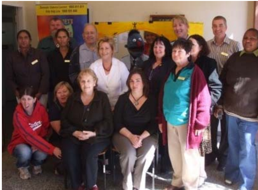
Puppets to the Rescue, Family & Domestic Violence Initiative, with Mount Isa Community Members