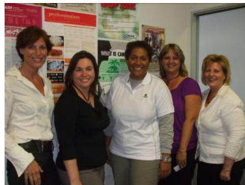
Substance Misuse Meeting