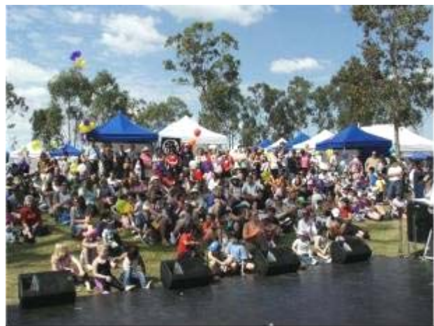
Springfield Community Day