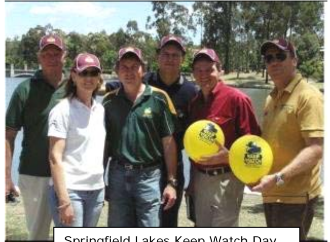
Springfield Lakes Keep Watch Day