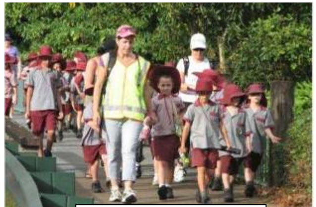
Forest Gardens Walking Bus