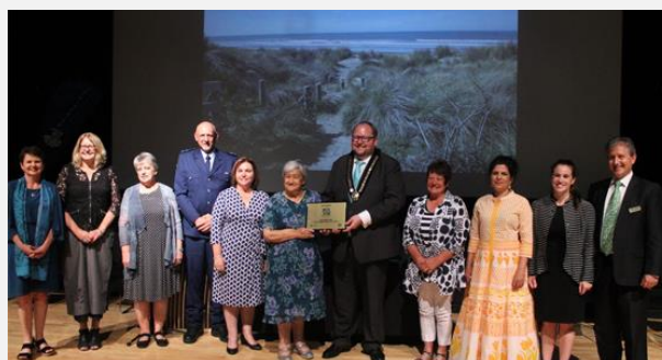
Pictured are signatories representing the key networks/organisations working in the area: Ngāi Tūāhuriri Rūnanga Police, Youth Council, Social Services Waimakariri, Waimakariri Health Advisory Group, Waimakariri District Council, Waimakariri Access Group.

Waimakariri is to be commended for the management of their community wellbeing programme so it has become business as usual in the development of community and individual resilience, safety, and wellbeing. In addition, the inclusion of Safe Communities in council's long-term plan and the holistic equity lens, along with the community empowerment approach, bodes well for the future.