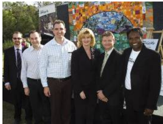
Woodlands Community Inc.