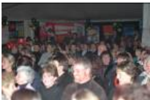
Scenes from the accreditation event

Woodend School has had a remarkable turnaround from 2001 when the school embarked on its safety upgrade - after serious concerns were raised about the emotional and physical well being of its students. There were problems with children at risk crossing the Main North Road, being bullied by others, or in danger of being injured by unsafe playground equipment or behaviour.